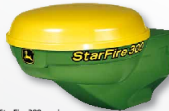
The StarFire 300 receiver

The new StarFire 3000 makes it easy to switch to the best signal for the job. Your John Deere dealer can activate SF2, RTK or Mobile RTK 'over the air', so there's no need for you to drop by unless you want to.