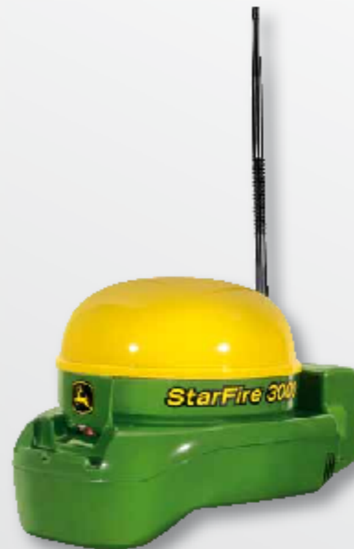
The new StarFire 3000 receiver